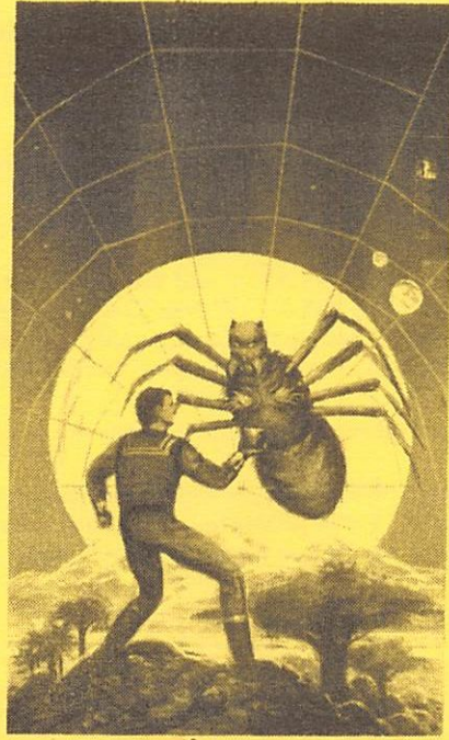
your Betraters harrientens

New England Science Fiction Association, Inc. Box G, MIT Branch Post Office Cambridge, MA 02139-0910 USA